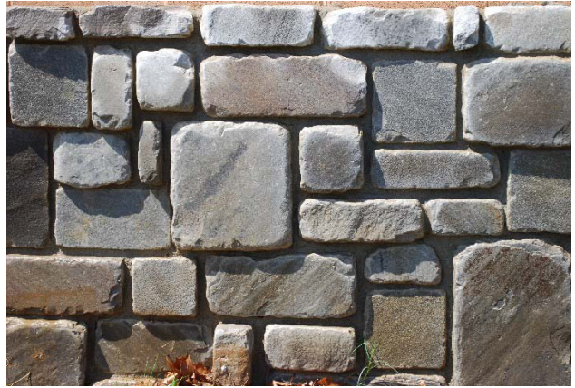
BLUE SEBASTIAN TUMBLED