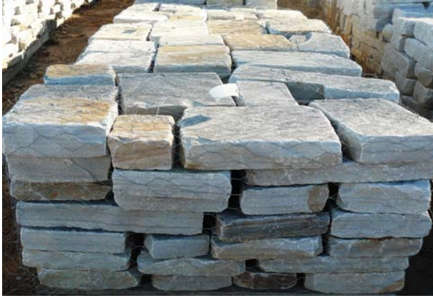
BLUE BROWN CHOPPED